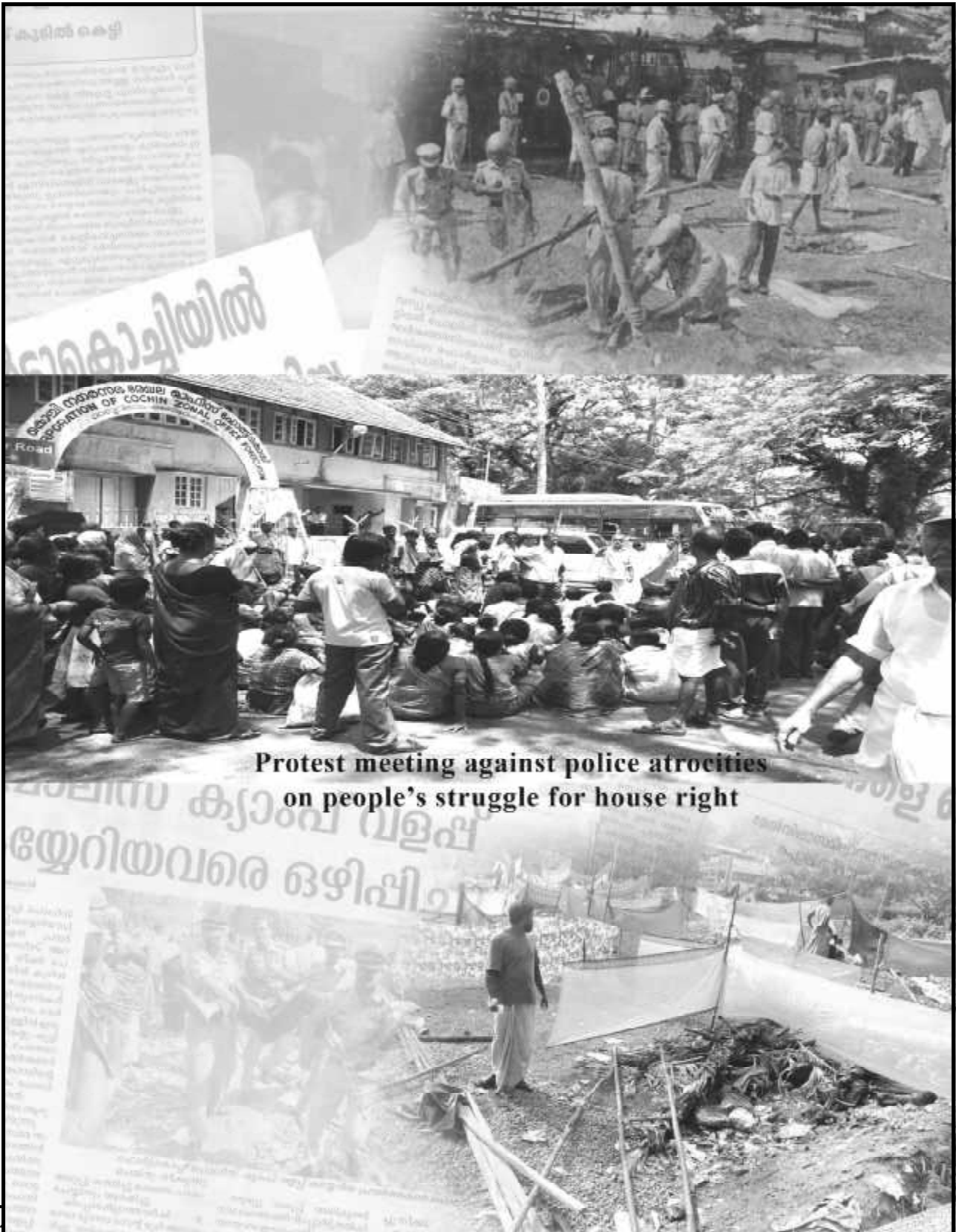
Protest meeting against police atrocities on people's struggle for house right

Postal Reg. No. : DL(S)-18/3162/2009-11 RNI Registration No. : DELENG/2000/615