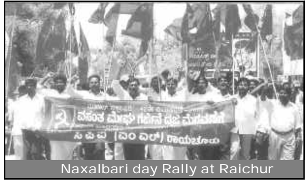
Naxalbari day Rally at Raichur

In Karnataka the party state committee gave call to observe Naxalbari Day for intensification of land struggle. With large number of poster, handbills and wall-writings a good campaign was organised at all place where party is active. On 25th May morning red flags were hoisted in number of villages. At Raichur