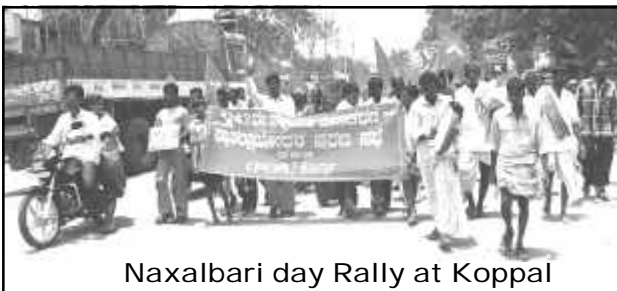
Naxalbari day Rally at Koppal

There are reports of observation of Naxalbari day at other centres in all other states also.